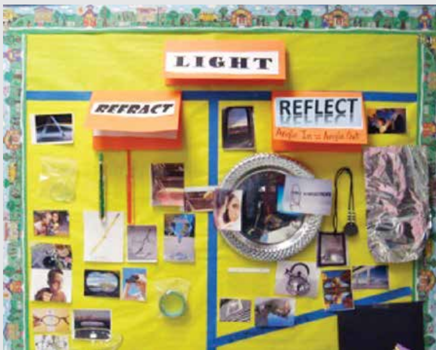
Light unit interactive word wall.