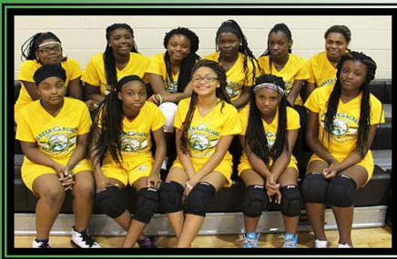
GAMS Volleyball Players